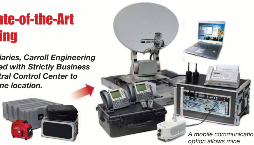
A mobile communication option allows mine operators to establish remote command centers.

Carroll Technologies Group and its subsidiaries, Carroll Engineering Co. and Delta Electric Inc., have partnered with Strictly Business Computer Systems to develop a Central Control Center to monitor multiple mines at one location.