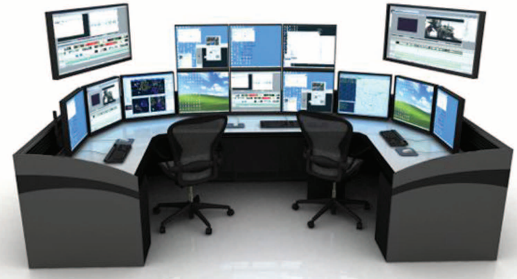
The new SaM Central Communications Center allows mine operators to talk across several platforms and monitor several mines from a single location.

Building on the West Virginia Legislature's action earlier in the year, the Mine Improvement and Emergency Response (MINER) Act of 2006 called for a communication or control center to monitor communication and tracking/locating systems whenever one or more miners are underground. The control center operator must be a certified underground miner, who is knowledgeable about the mine's layout, communication network, warning systems, escape-ways, and emergency response plans (ERPs). The mines need to report accidents to the appropriate agencies within 15 minutes of the occurrence.